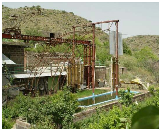
ECOSERV ROC Company's Experimental Site, for measurements of soil, snow, vegetation and water surface microwave reflective and emissive characteristics angular dependences under test-control, quasi-field conditions

A single or multi-frequency, multi-polarization, combined radar-radiometer system has been developed in Armenia and there is no such a technology all over the world. It allows to measure microwave reflective and emissive characteristics of the observed surfaces simultaneously at two frequencies and four polarizations and to study and control conditions of various environmental surfaces and media (soil moisture, water temperature and salinity, air temperature, snow moisture and melting time, etc.), to record and distinguish available changes of the Environment.